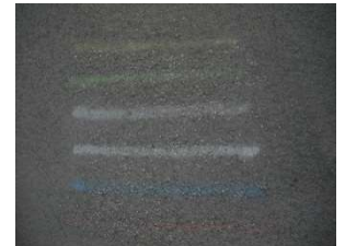
Same paint after being scrubbed with a brush and soapy water